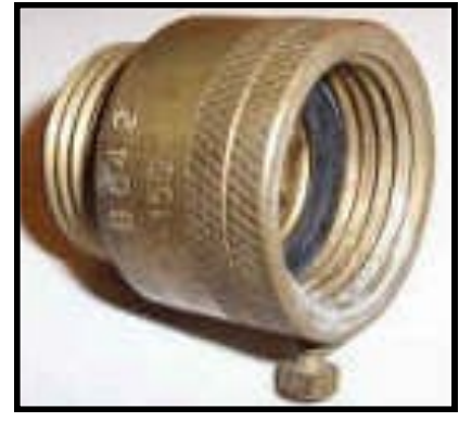
Backflow Preventer/Vacuum Breaker

the home and used to satisfy the needs of the current user(s) - whether they are showering, brushing their teeth, getting a drink, doing laundry, etc.