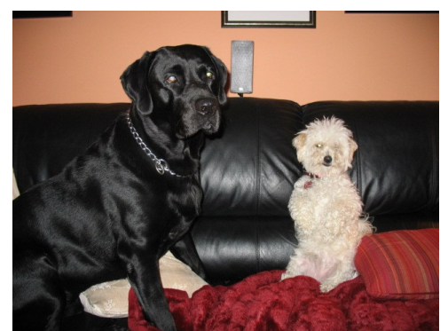
What brown spots? Who, us?

If fertilizing efforts in past years have had questionable results, you may want to consider having your soil tested to determine the composition of your soil before performing any application of lawn care products - this may cause you to alter or supplement the type of fertilizers, crabgrass preventatives, insect control compounds, etc. that you apply.